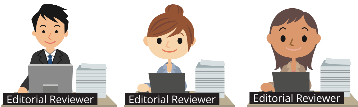
Editorial Reviewer Editorial Reviewer Editorial Reviewer

Production Editor sends redacted submissions to Editors.