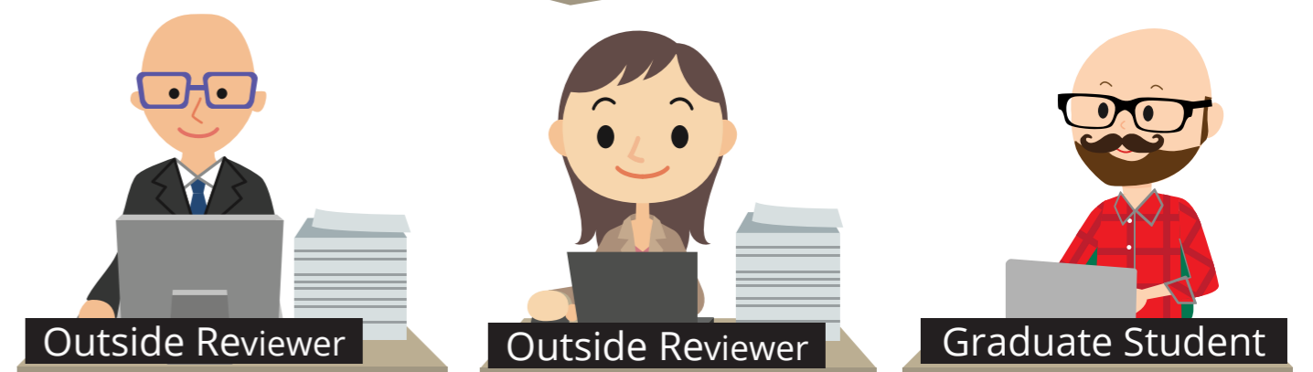
Outside Reviewer Outside Reviewer Graduate Student

The Manuscript Editor recruits two or more (generally not more than three) outside Reviewers and delivers the manuscript to them within two weeks of taking assignment of the manuscript.