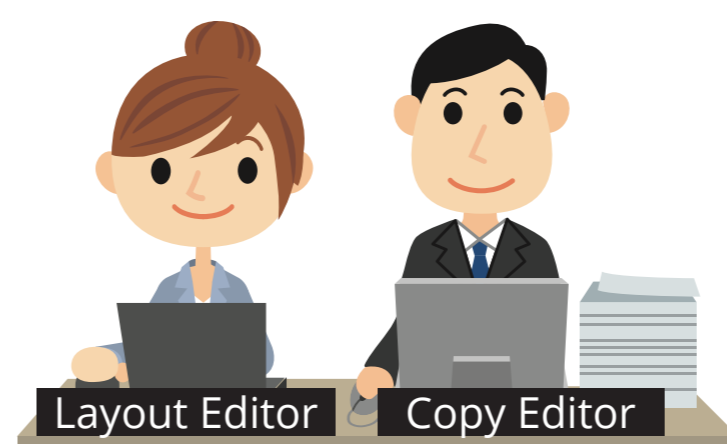
Layout Editor Copy Editor

The Layout Editor and Copy Editor then proof, edit, and lay out the manuscript in galley form within two weeks of receipt of appropriately formatted and accepted finalized materials. The galley is then sent to Manuscript Editor and Author for final review prior to publication.